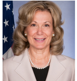
Ambassador Deborah L. Birx U.S. Global AIDS Coordinator and U.S. Special Representative for Global Health Diplomacy

The U.S. government continues to drive progress under the PEPFAR Strategy for Accelerating HIV/AIDS Epidemic Control (2017-2020), under which several African countries are now on track to control their HIV epidemics by the end of 2020. The Strategy also reaffirms PEPFAR's commitment to more than 50 countries worldwide and to ensuring that all populations, including key populations and other vulnerable groups, can access HIV prevention and treatment services in ways that meet their needs.